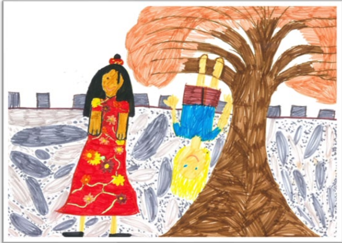
Laura (aged 9) talking with a girl from China