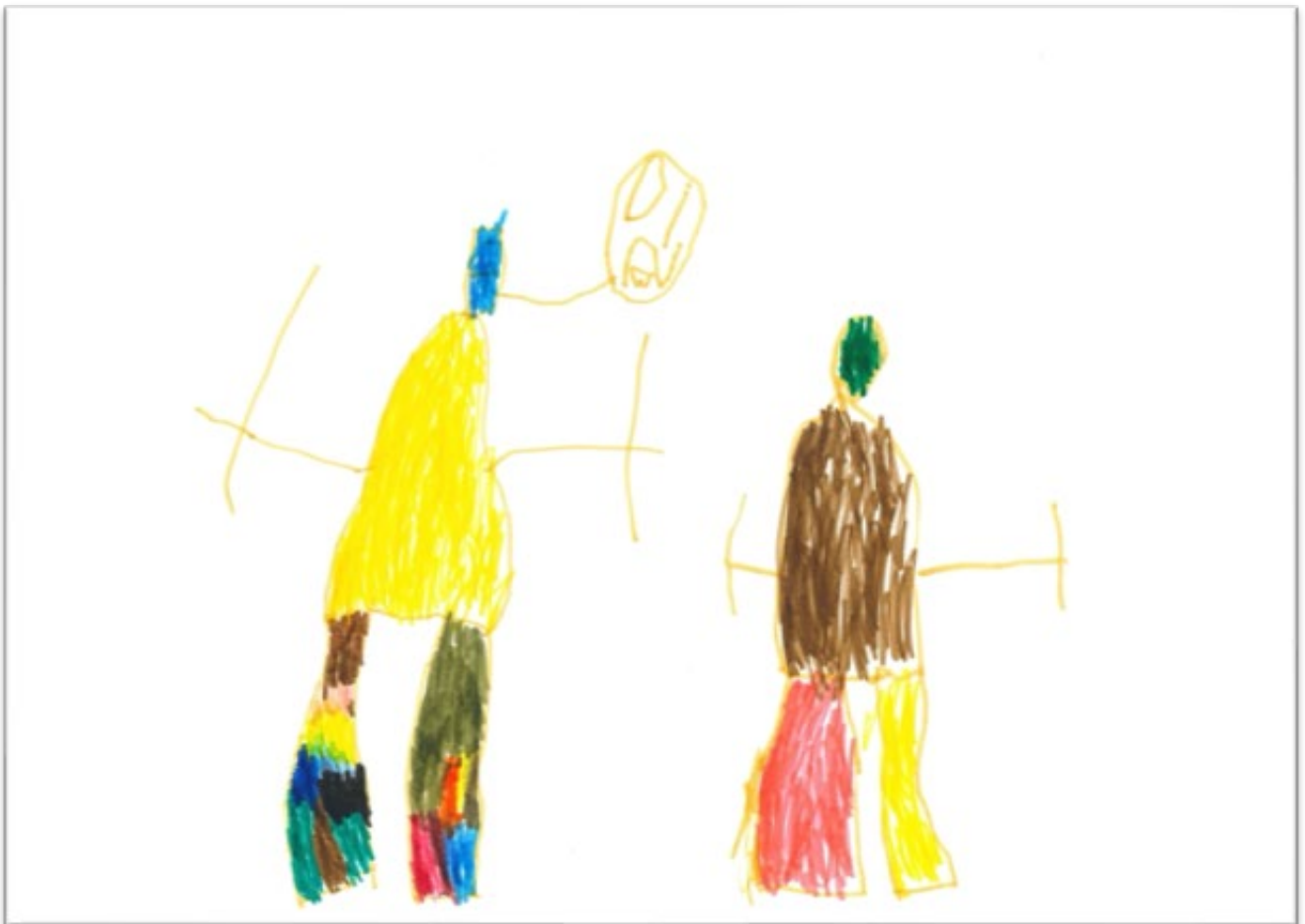
Hayden (aged 4) talking with Dad. "I'm actually writing a word DINO"