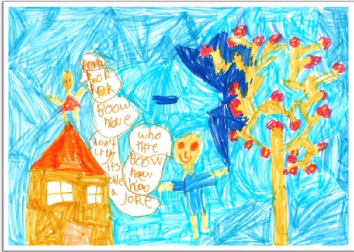
Sammy (aged 6) "going to do a knock knock joke" with my Dad