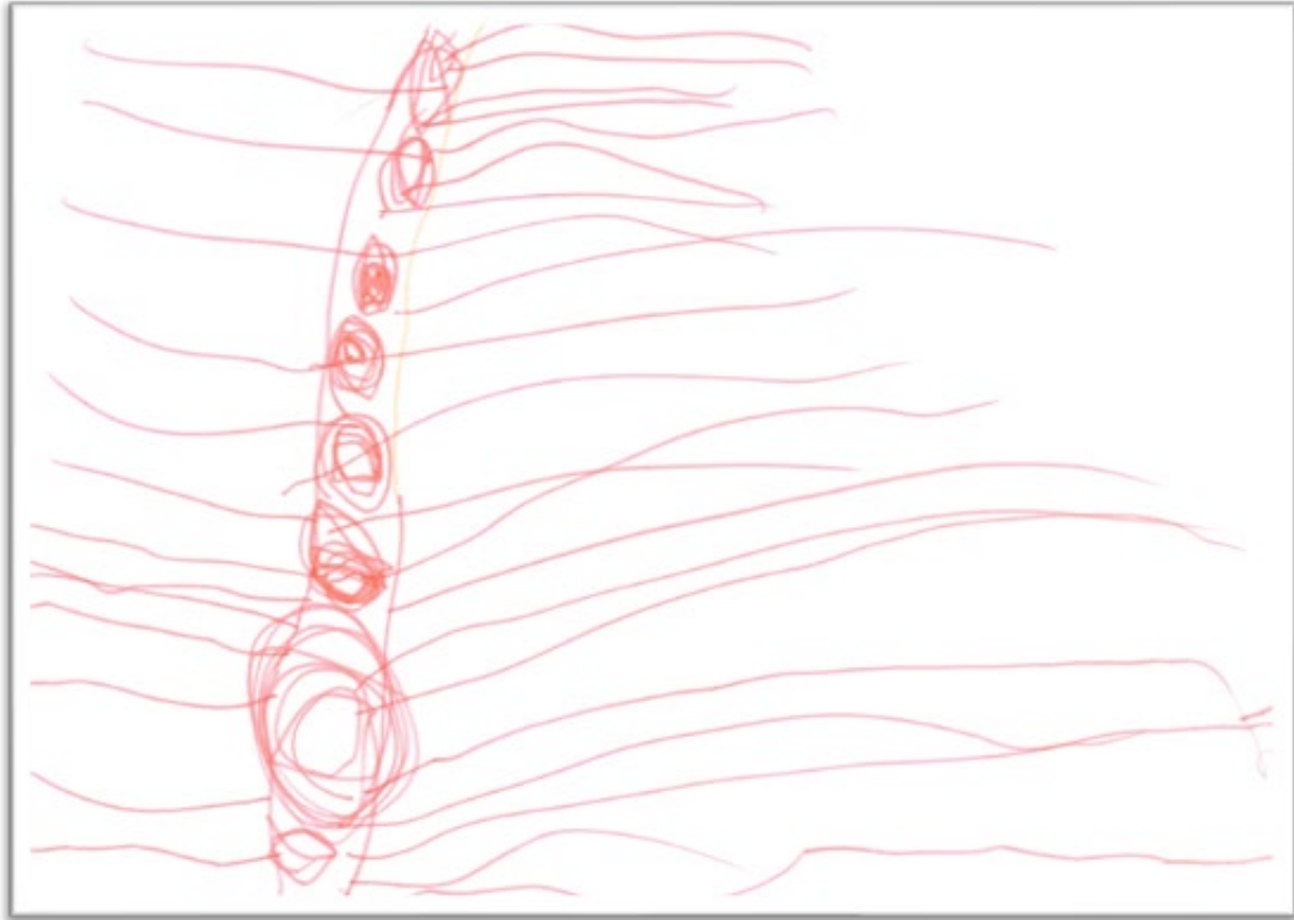
Maya (aged 3) "I'm making a silly octopus"